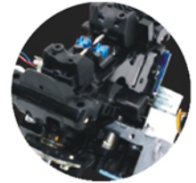
Integrated fiber-adjust frame

Built -in Japanese components and Korean chipset